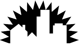
EXHIBIT SPACE APPLICATION & CONTRACT